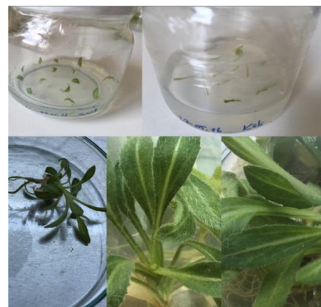
Fig. 3. Explants (3a, 3b) and obtained plants (3c, 3d) from Chinese material