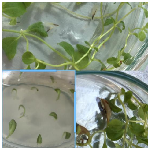
Fig. 4. Explants (4b) and obtained plants (4a, 4c) from Bafra material

Stevia large-scale production is needed for industrial applications. Seeds of Stevia show a very low germination percentage (Felippe and Lucas, 1971; Toffler and Orío, 1981), and vegetative propagation through cuttings is limited by the small number of individuals (Sakaguchi and Kan, 1982). Tissue culture is the only rapid process for the mass propagation of Stevia .